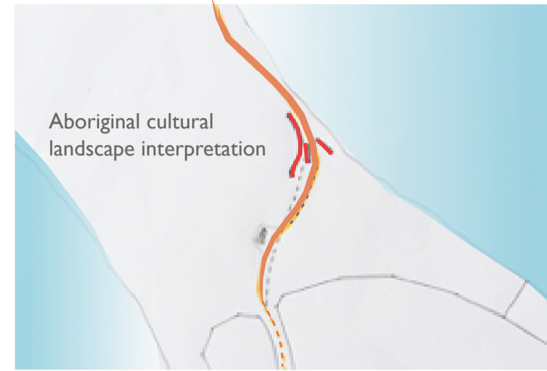
New entry path retraces historic spitfarm road