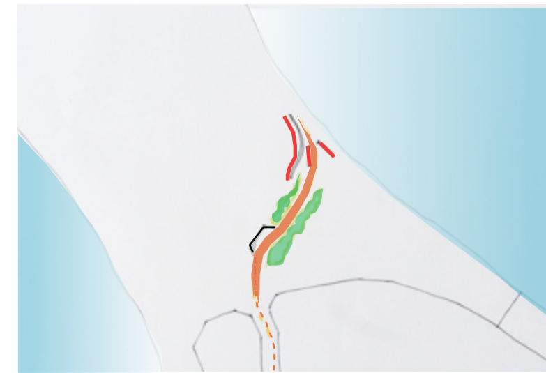
A sense of staged arrival informed by Indigenous and European cultural heritage