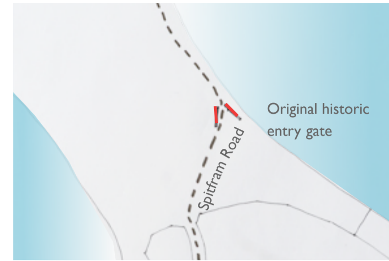
Original spitfarm road route