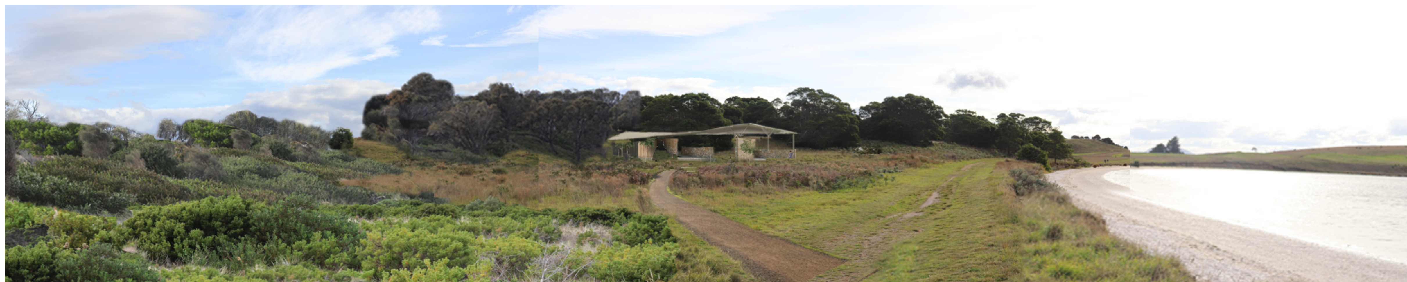
3. Integrate infrastructure in entry circuit to minimise visual and environmental impact