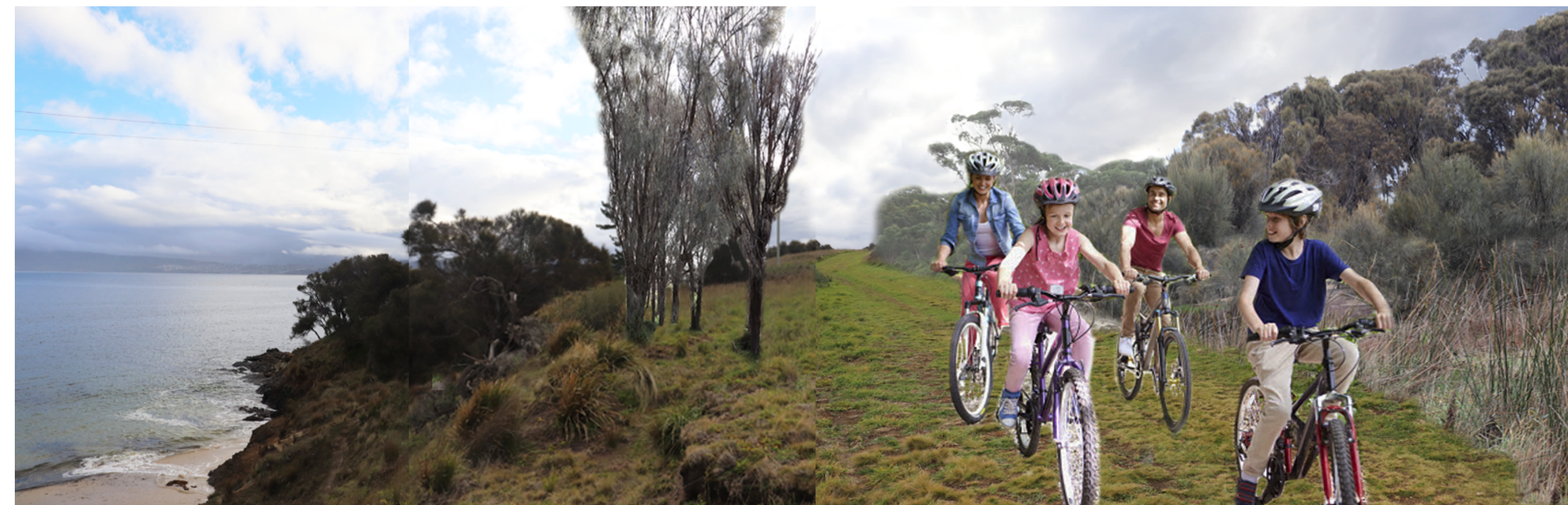
2. Allocate wide vehicle tracks for bike riders - view looking north, end of Mitchells Beach