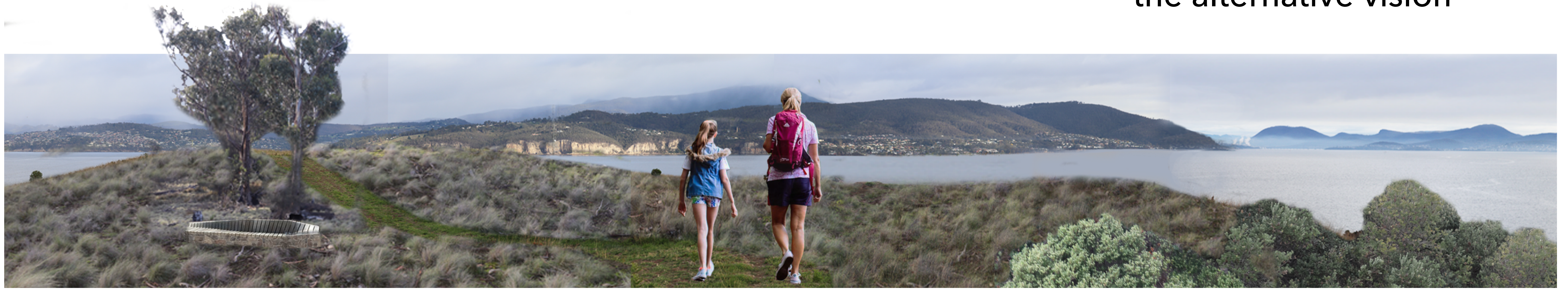
1. Open space for safe walking circuits with panoramic views - view from 'Quail Ridgeline Track'