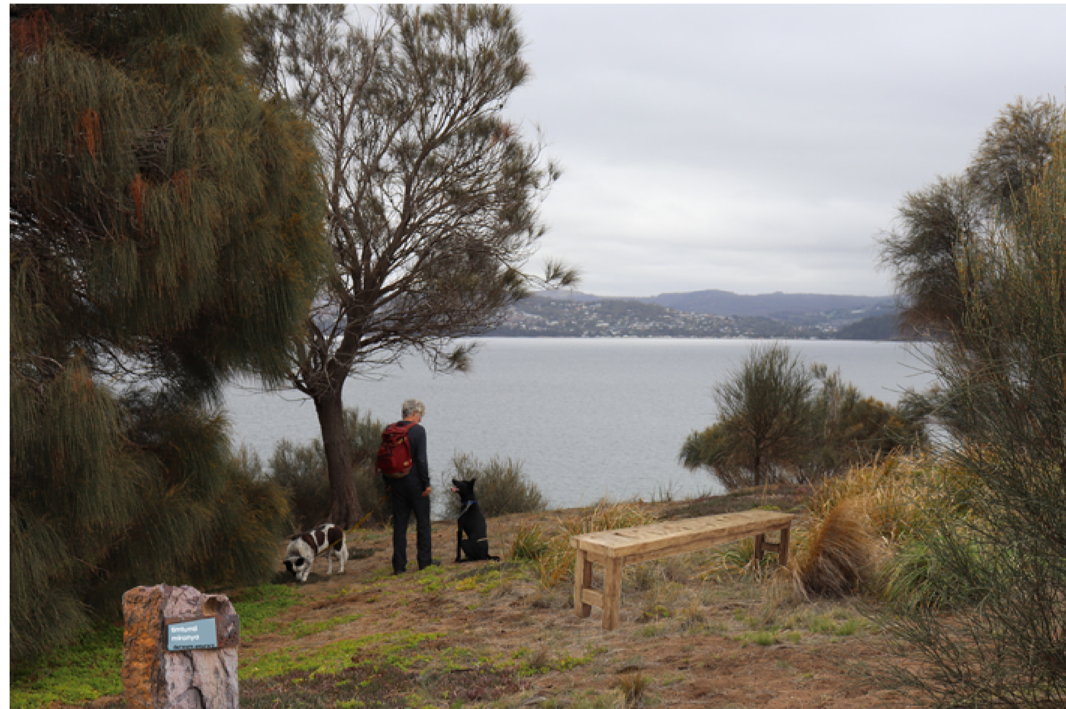
1. Concept image of interpretative element recognising the cultural significance of the Derwent estuary

A significant headlands in the River Derwent, this country was an important hunting ground, meeting place, ceremonial site and living place. Rocky Sainty 2013