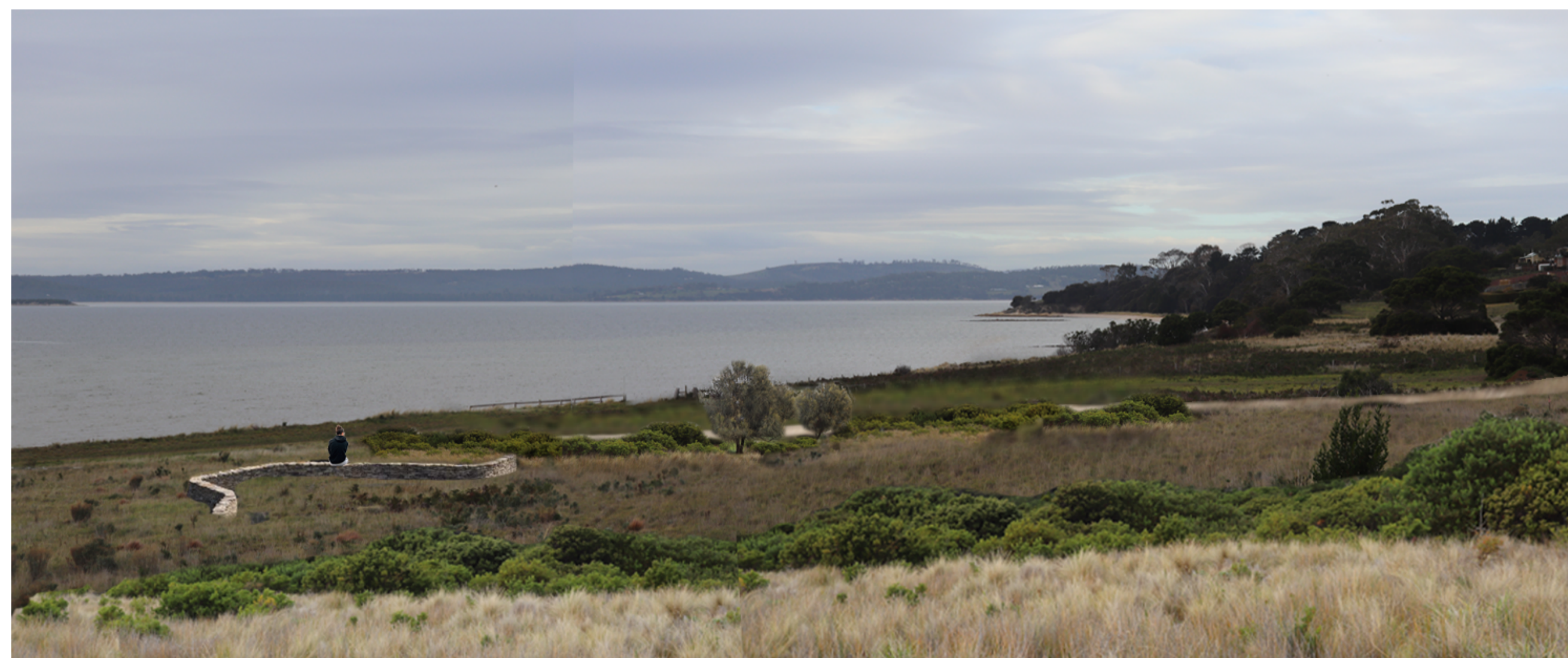
2. Land art element responding to the midden site on Shelly Beach, an opportunity for education about traditional owners and their relationship with country