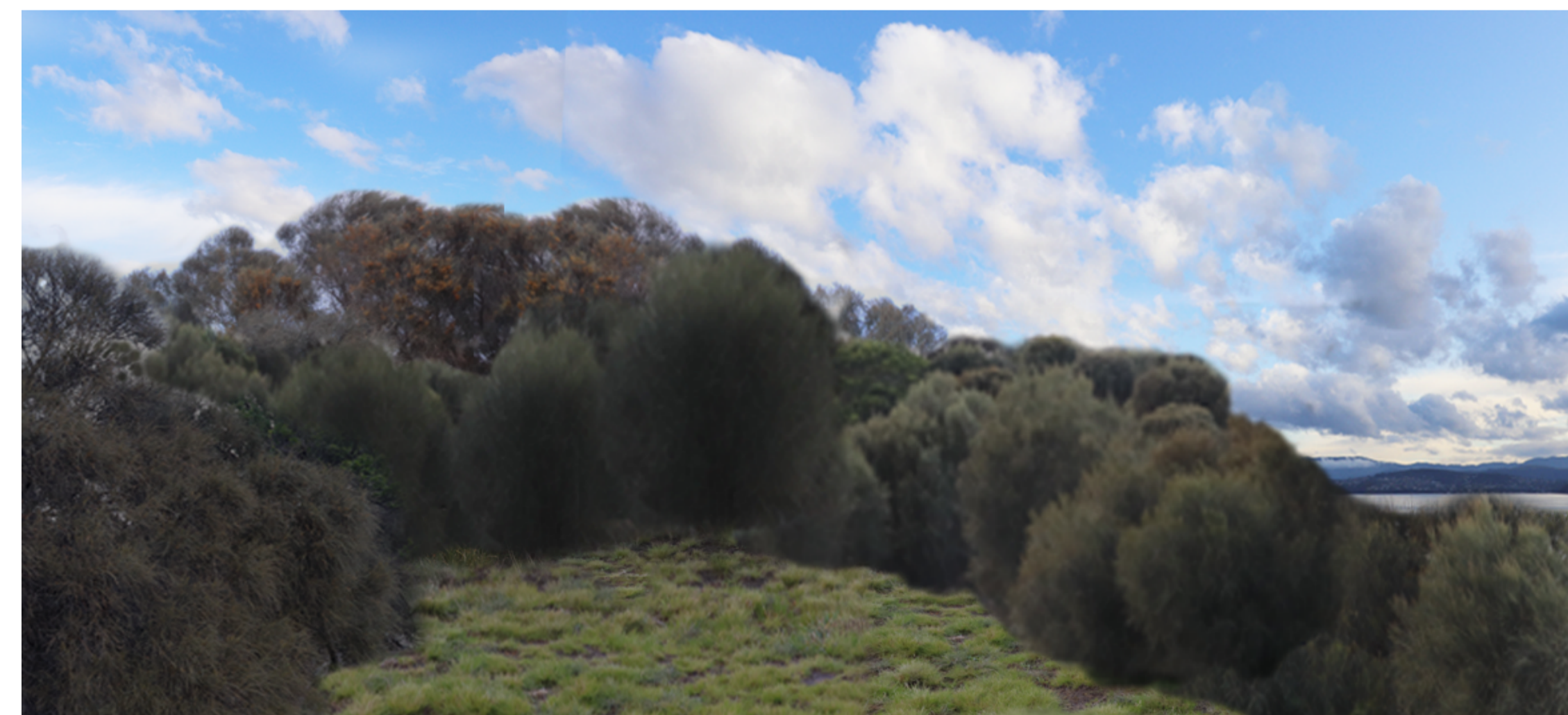
2. Clearing at Gellibrand Point