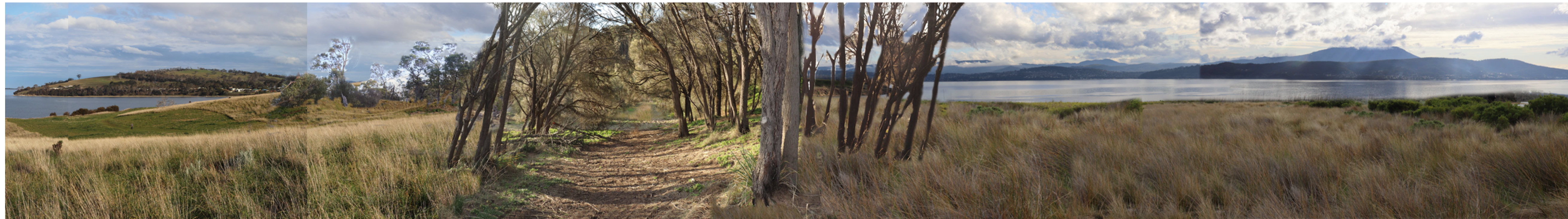
1. View from Reconciliation aboretum looking south